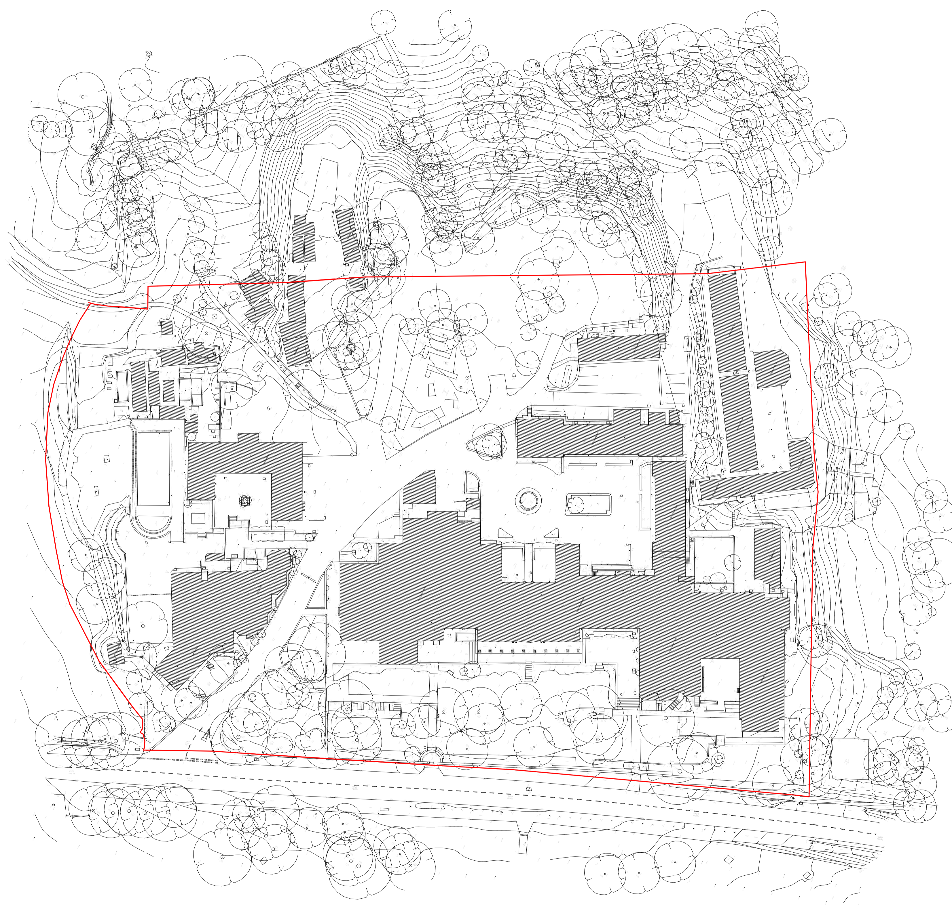
10002 - Existing block plan 1 : 500

Notes Do not scale from this document, unless for the purposes of planning applications where a scale bar is provided. Refer to figured dimensions only. All dimensions to be verified on site prior to construction. Report all discrepancies or ambiguities to the Document Originator immediately. This document is to be read in conjunction with relevant documents, drawings and standards.